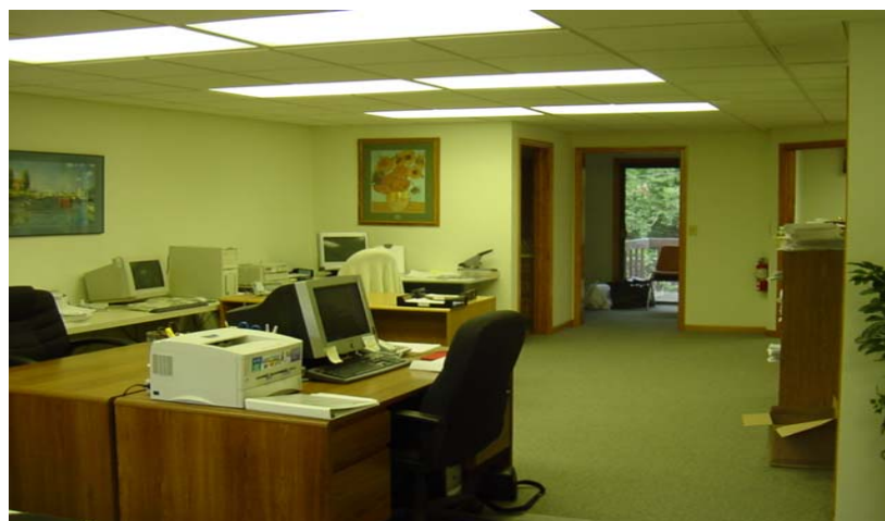
First Floor office area