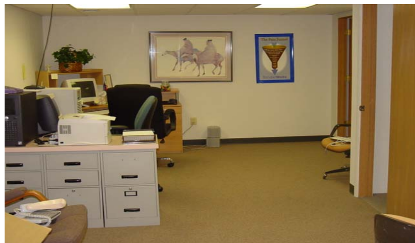
Lower Level office area