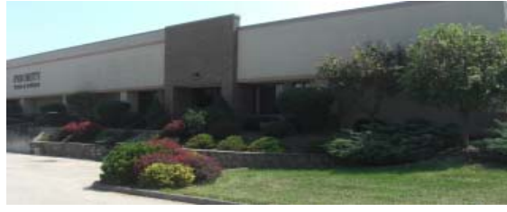
4404 Hamilton Cleves Rd. Hamilton, OH (Butler County)