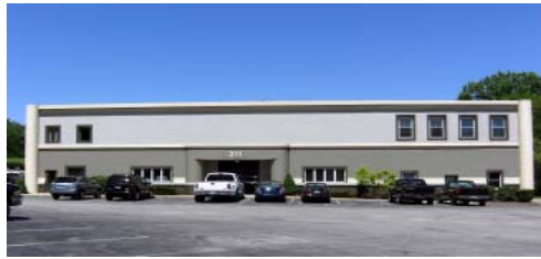
211 Walnut Street Lebanon, OH (Warren County)