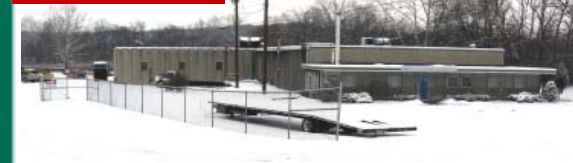
800 Kent Road Batavia, OH (Clermont County)