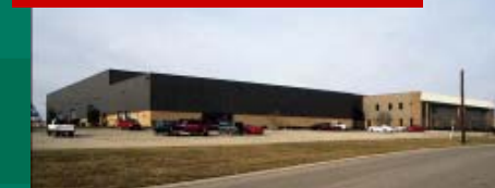
9759 Inter-Ocean Drive, Cincinnati (Butler County)