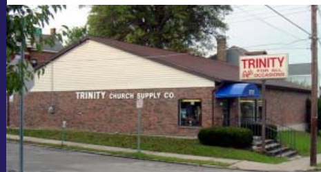
3727 St. Lawrence Avenue Cincinnati, OH (Hamilton County)