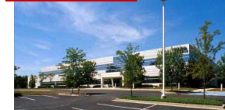
4101 Founders Blvd., Batavia (Clermont County)