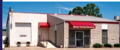
2964 P.G. Graves Lane Evendale, OH (Hamilton County)