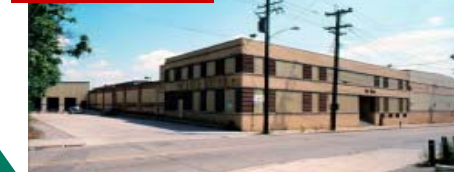
1780 Dreman Ave. & 1781 Weber St. Cincinnati (Hamilton County)