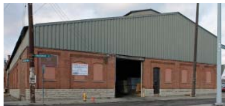
1020-1050 Mehring Way Cincinnati, OH (Hamilton County)