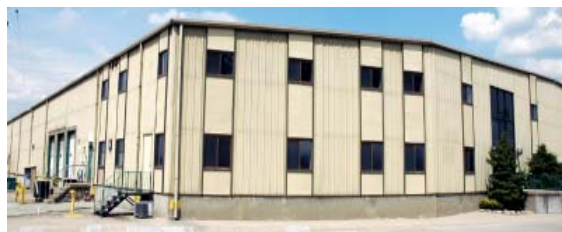
1000 Kieley Place Cincinnati, OH (Hamilton County)