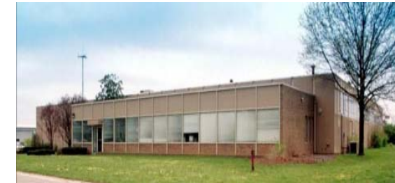
925 Redna Terrace Woodlawn, OH (Hamilton County)