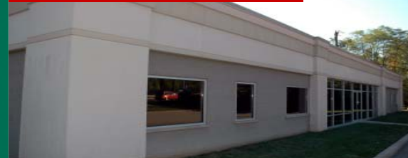
10036 Springfield Pk. Cincinnati, OH (Hamilton County)