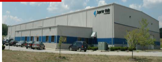
3425 Grant Drive Lebanon, OH (Warren County)