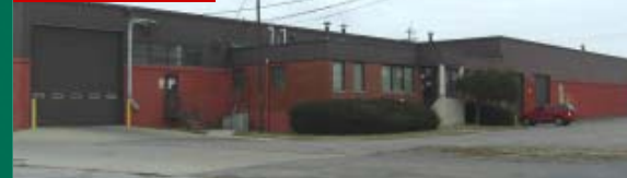
10346 Evendale Dr. Evendale, OH (Hamilton County)