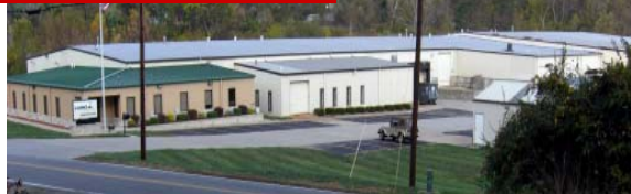
2130 Tuley Road Hamilton, OH (Butler County)