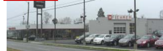
2531 Dixie Hwy. Fairfield, OH (Butler County)