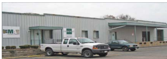
5145 Fisher Place Cincinnati, OH (Hamilton County)