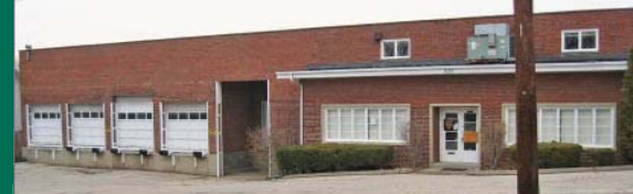
1630 Sherman Ave. Cincinnati, OH (Hamilton County)