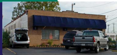
2974 P.G. Graves Lane Evendale, OH (Hamilton County)