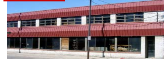
5601 Montgomery Rd. Cincinnati, OH (Hamilton County)