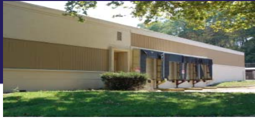
4821 Rockdale Road Lemon Twp., OH (Butler County)