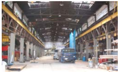
3323 Colerain Ave./1340 Monmouth Ave.