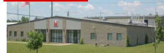
11275 Sebring Drive Forest Park, OH (Hamilton County)