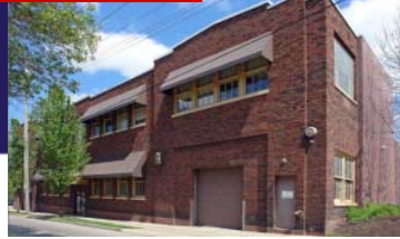
812 Russell Street Covington, KY (Kenton County)