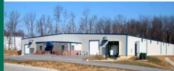
2024 Northwest Dr. Cincinnati, OH (Hamilton County)