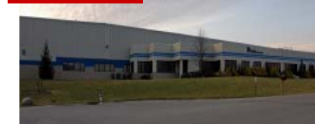
119 Northeast Drive, Loveland (Hamilton County)