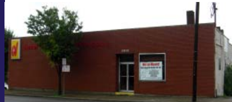
3032 Reading Road Cincinnati, OH (Hamilton County)