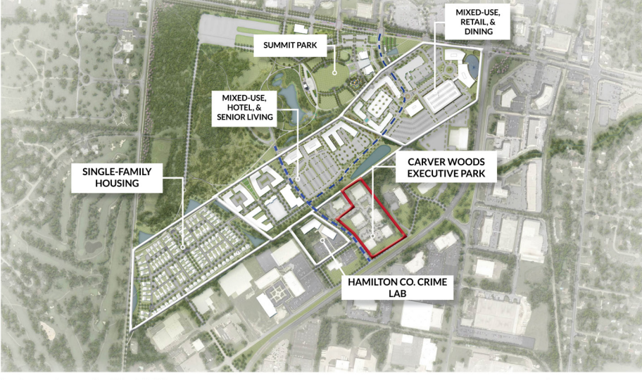
Development Progress Map | Blue Ash, OH - - Access to Summit Park and Glendale Milford Roa