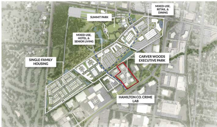
Development Progress Map | Blue Ash, OH --- Access to Summit Park and Glendale Millford Road